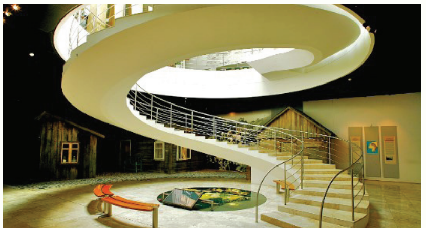
Inside of the Jewish Museum