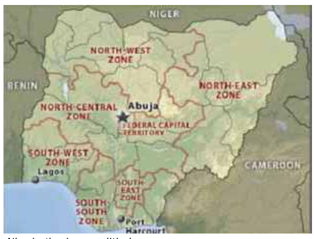
Nigeria: the six geo-political zones.

This preliminary overview seeks to draw attention, albeit briefly, to the pivotal place of religion in the