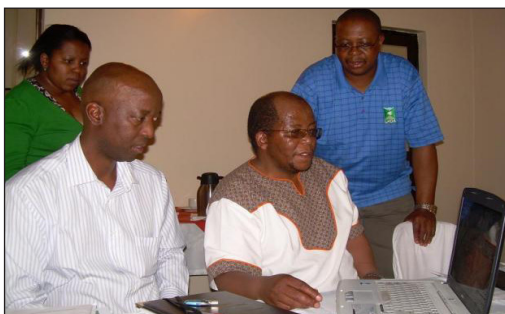
Above: The ALP Lesotho team