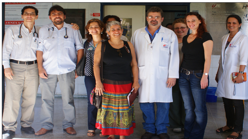
Right: A visit to the provincial hospital in Recife, Pernambuco with colleagues in the Brazil-South Africa collaboration