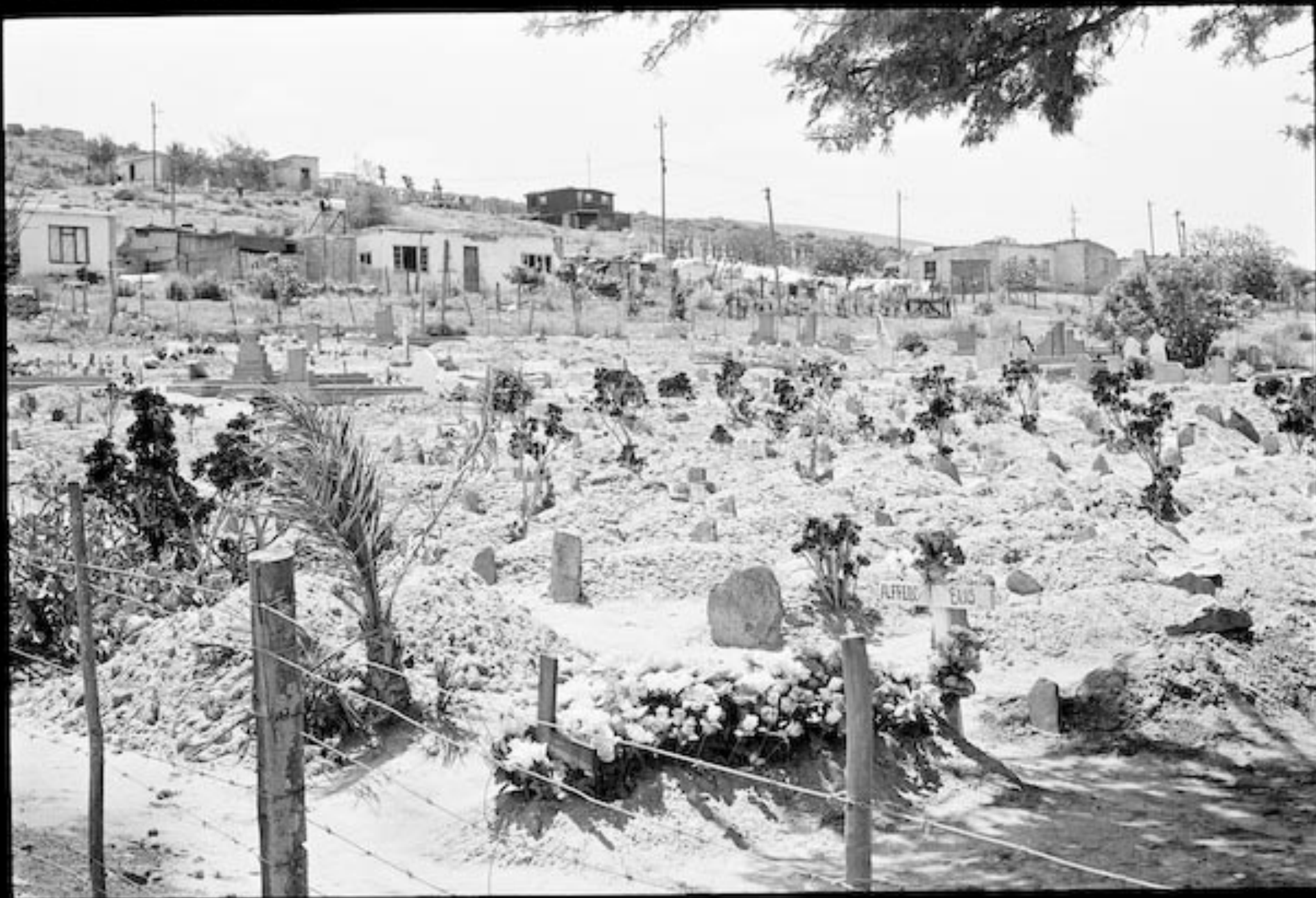
Buis Plaas cemetery, Buffelsdrift. Western Cape 2018 Gouritz River. 2018