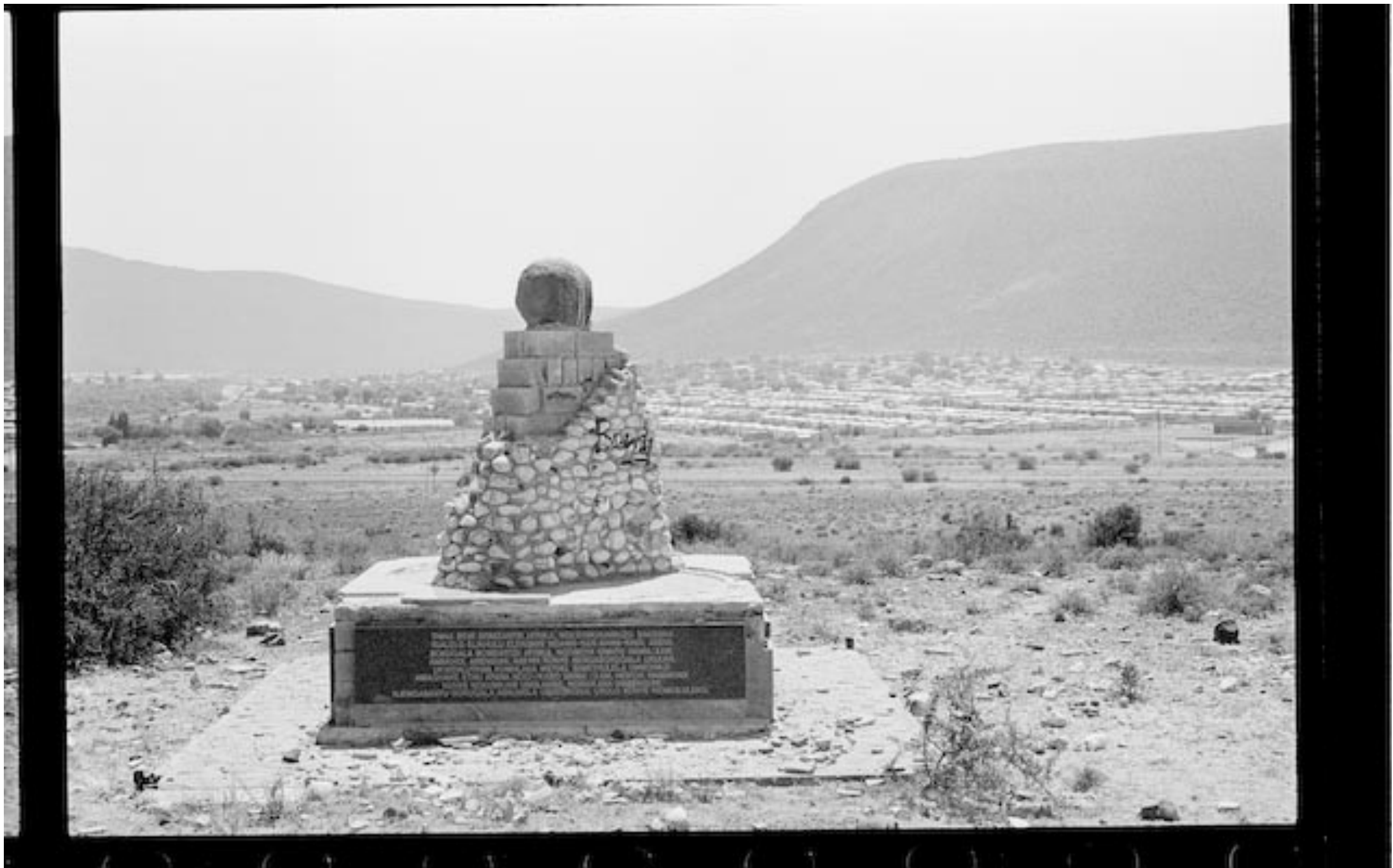
Memorial to the genocide of the Bushmen. Graaf-Rienet 2018