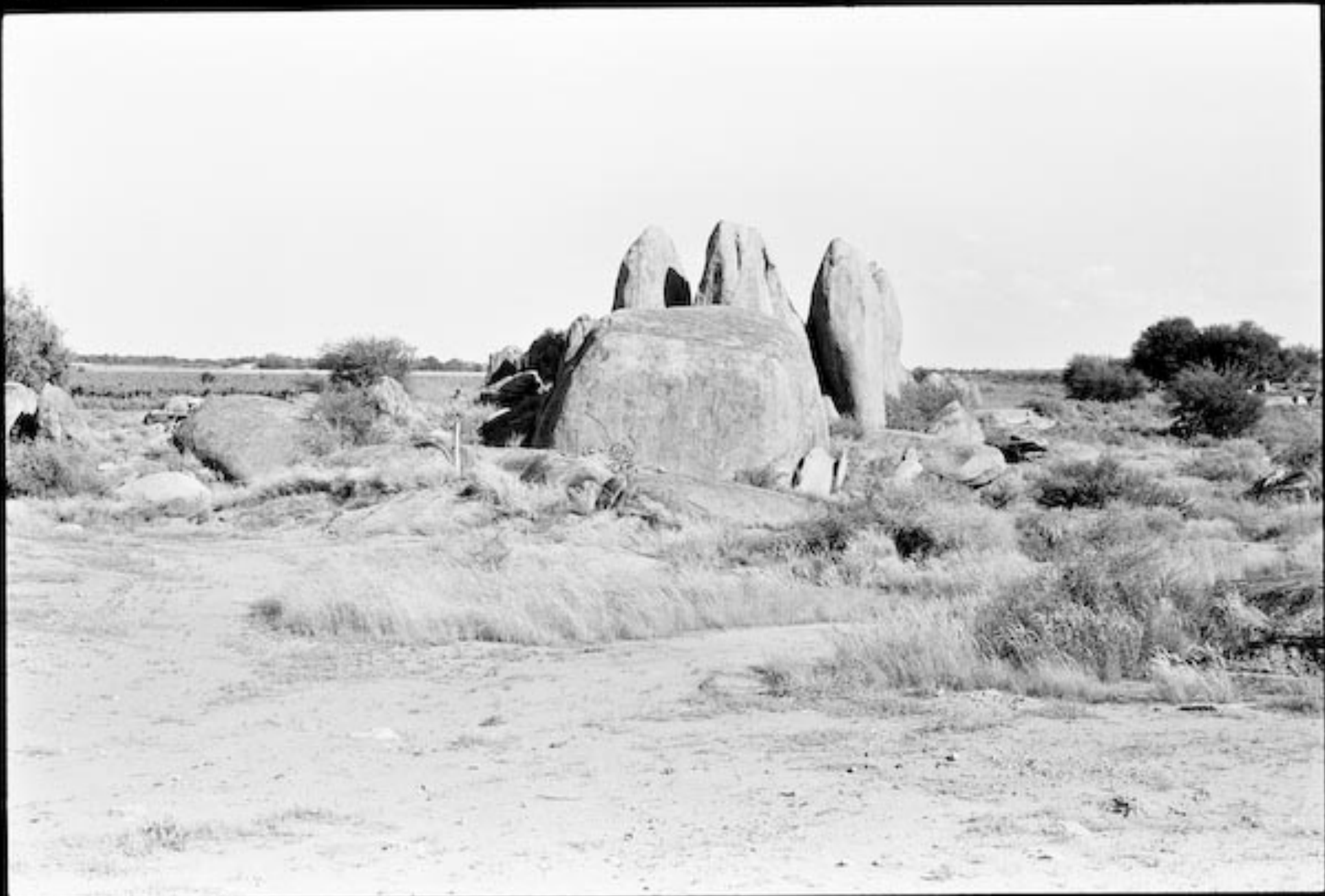
Ou Dyason's Klip, site where one of the last Bushmen defenders was shot dead on the banks of the Orange River. Kemos, Northern Cape 2017