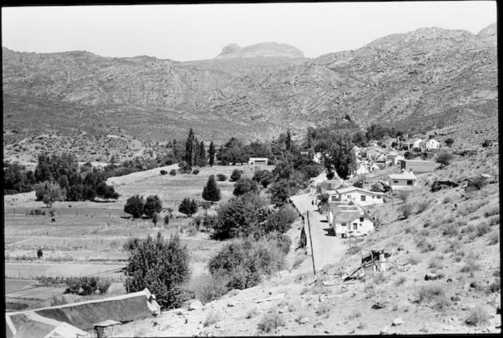
Wupperthal village. 2017