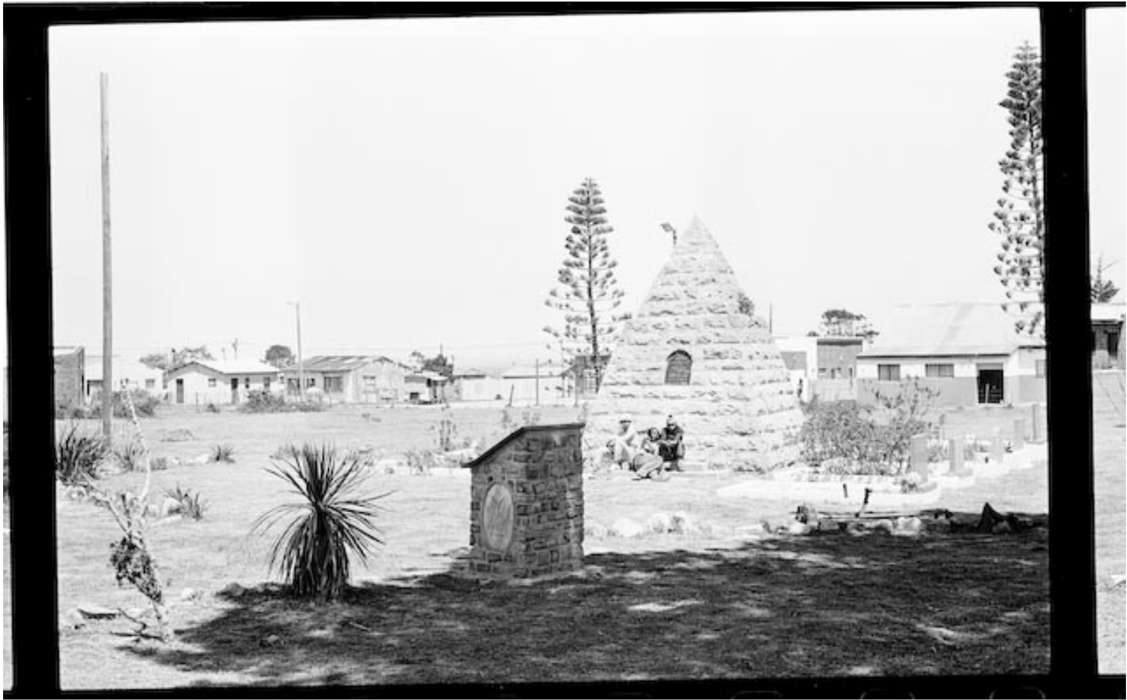
Memorial at the grave of Griqua leader Andrew Abraham Stockenstroom Le Fleur. Kranshoek. Plettenberg Bay 2018