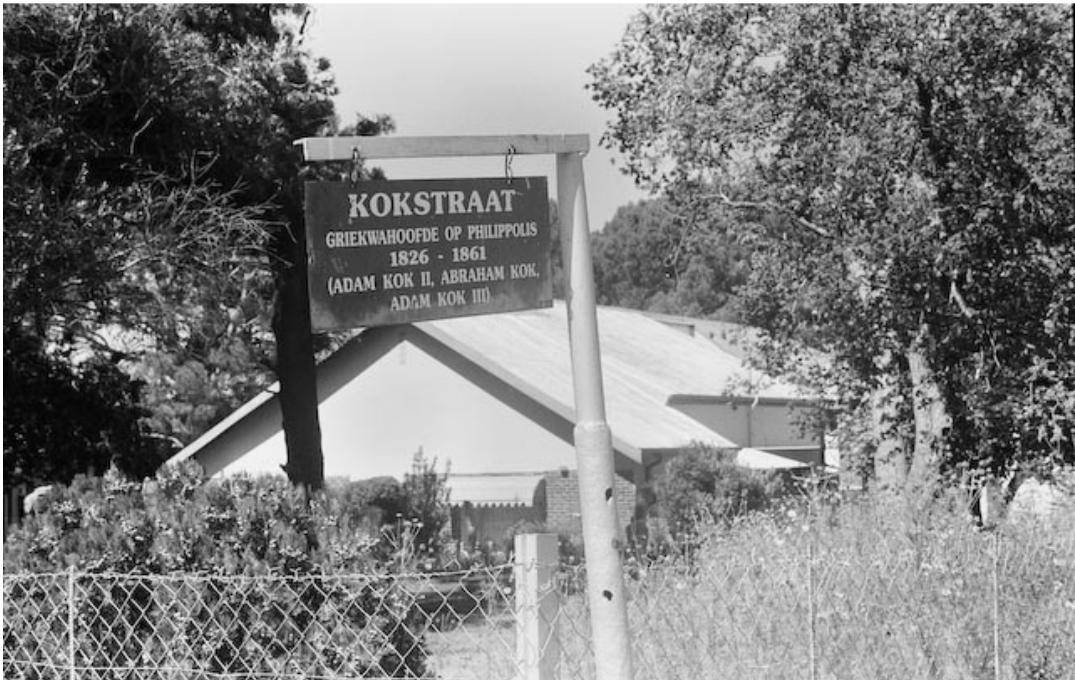
Kokstraat, A remnant and reminder of the once sovereign state of the Griqua Nation. Philippolis 2017