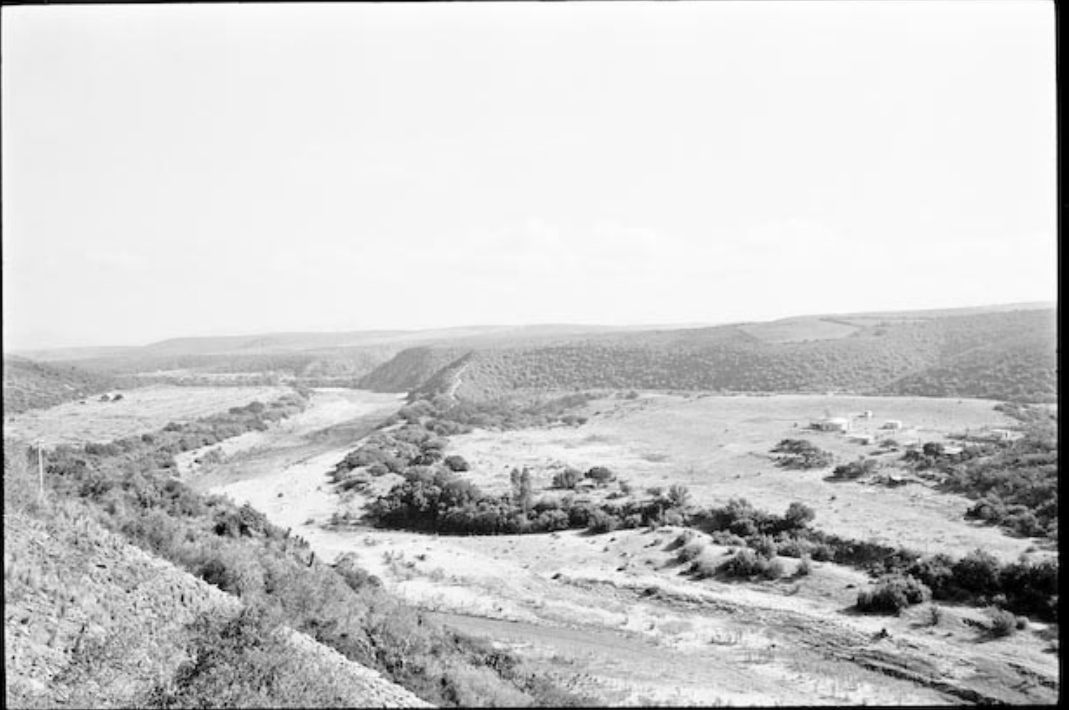
Gouritz River, Western Cape. 2018