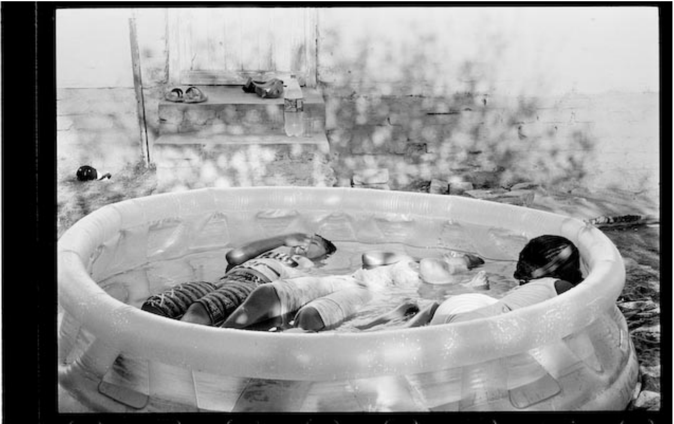
Kids refresh themselves in the afternoon Summer heat of Pienaar Sig. Nieu-Bethesda 2018