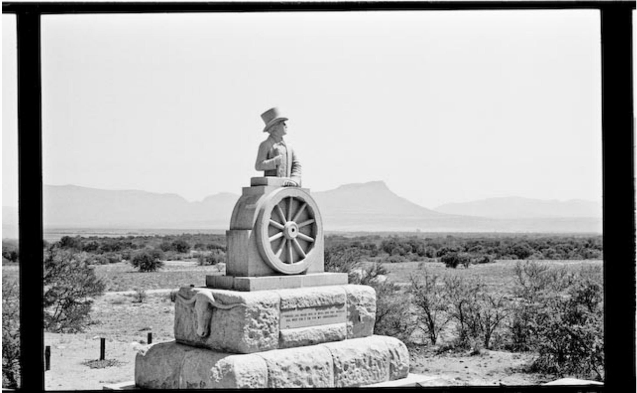
Andries Pretorius monument, celebrating the Great Trek leader. Graaf-Reinet, Camdeboo National Park. 2018