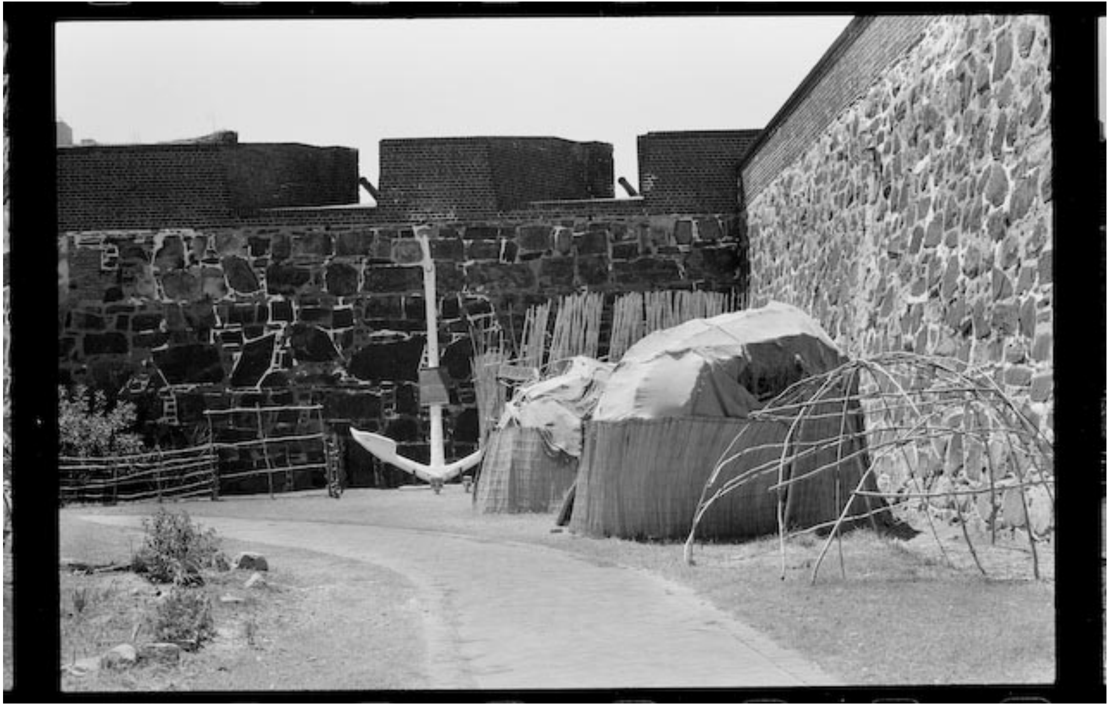
Khoe Village huts, Castle. Cape Town 2017