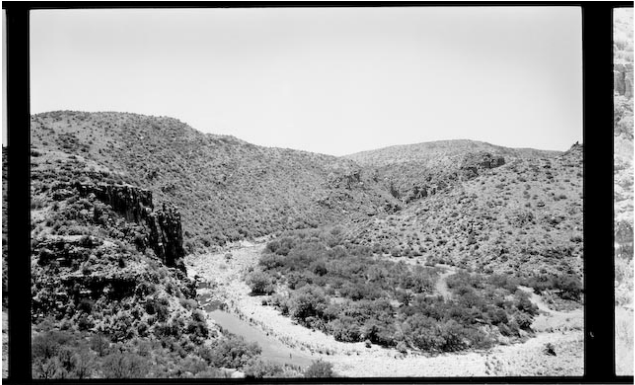
Kloofs in the vicinity of Nieu Bethesda where Bushmen were herded off the cliffs to their deaths in the genocide that they endured in the late nineteenth century. 2018