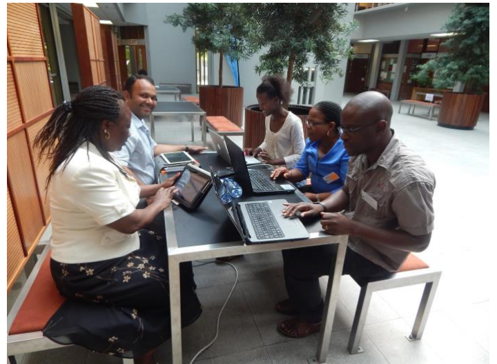
Photos: Expert input at a PhD event (top left), PhD proposal presentation (top right), PhD research group meeting (bottom left), and Open Wifi Zone for PG students (bottom right).