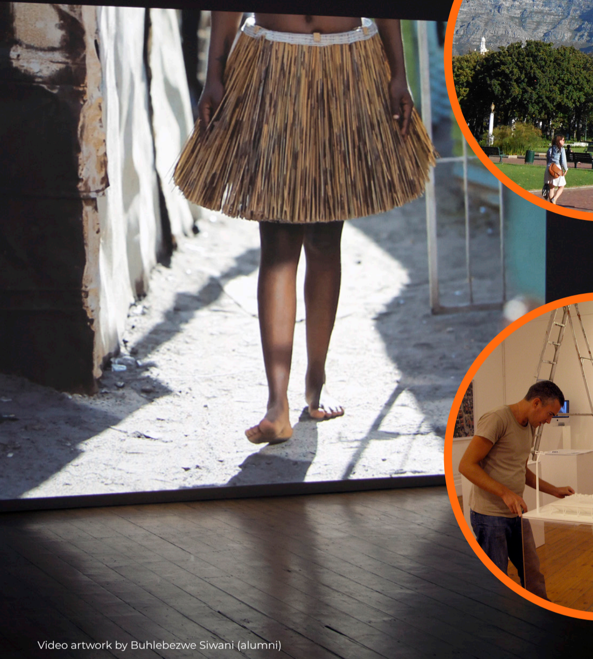
Video artwork by Buhlebezwe Siwani (alumni)