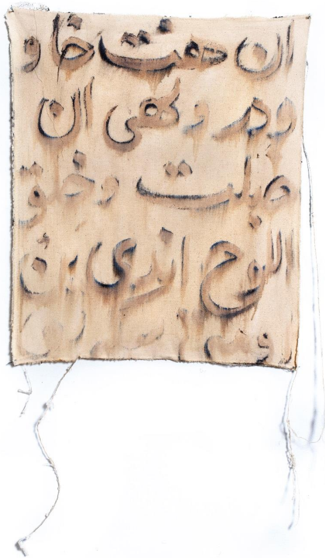
Untitled (Book of Tawhid XVI), Ink, bleach and cold glue on canvas, 92 * 77 cm.