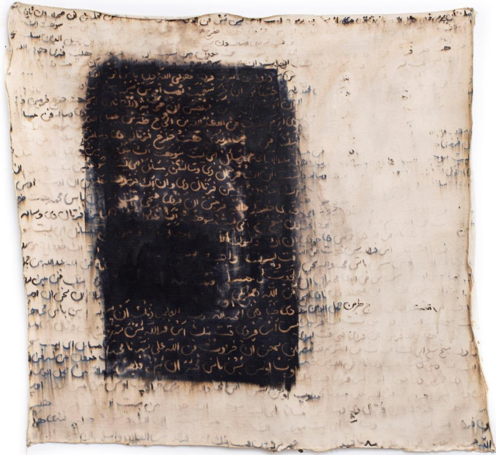
Untitled (Book of Tawhid XIX), ink, bleach and cold glue on canvas, 135 * 125 cm.