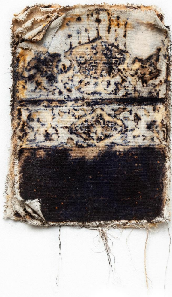
Untitled (Kitaab XIX) Ink, bleach and cold glue on canvas, 27 * 20 cm