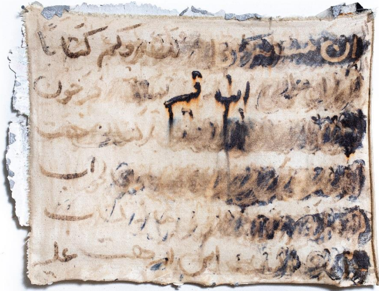
Untitled (Gairodien's student notebook IX), ink bleach, cold glue and wall paint on canvas, 56 * 41 cm.