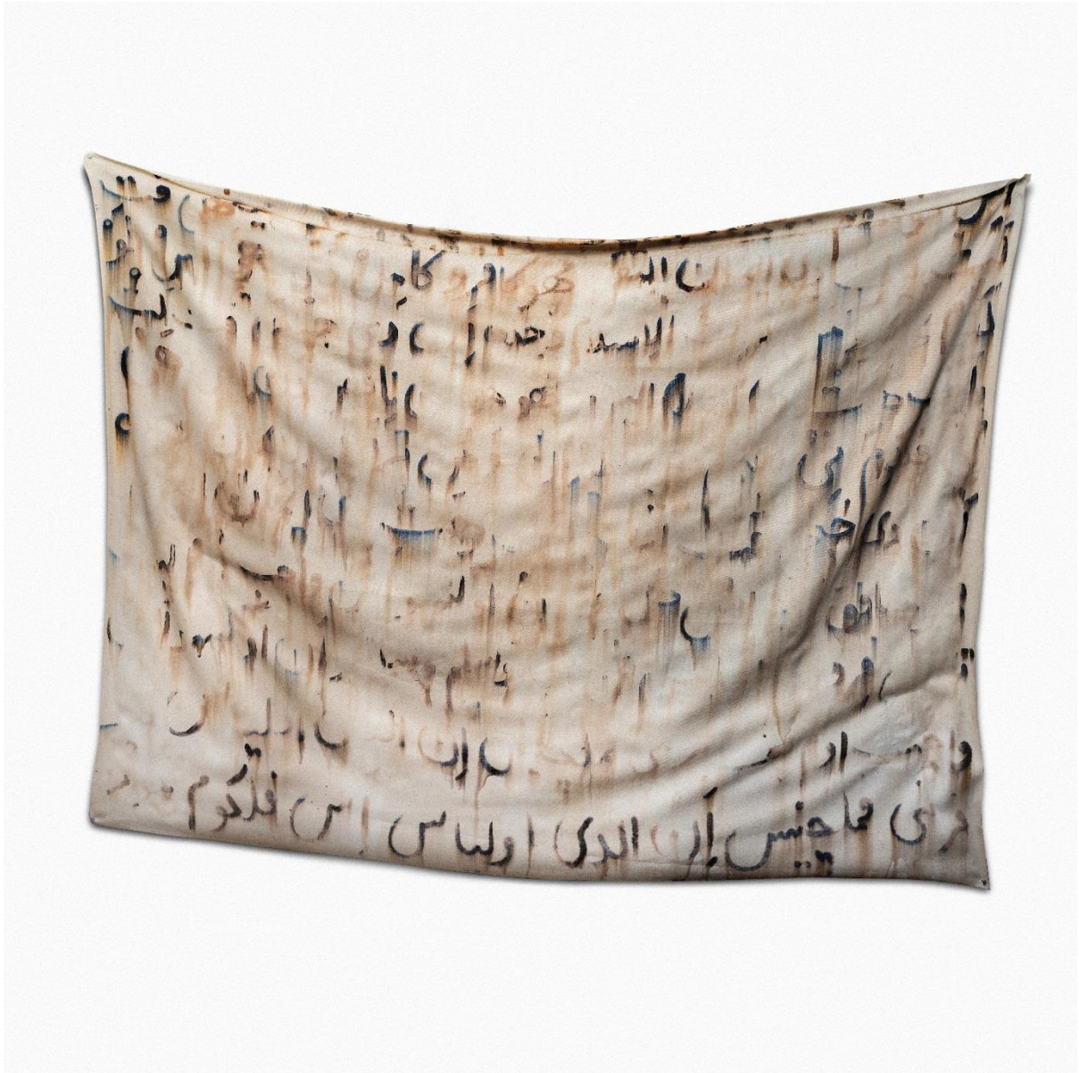
Untitled (Book of Tawhid XIV), ink, bleach and cold glue on calico, 145 * 118 cm.