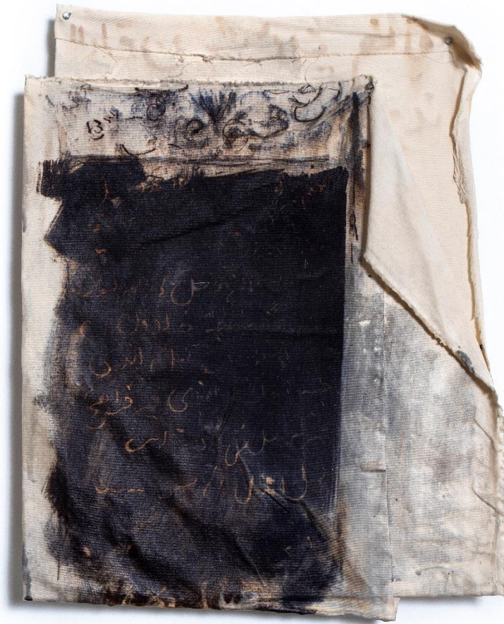
Untitled (Kitaab XV). Ink, bleach and cold glue on canvas, 54 * 43 cm.