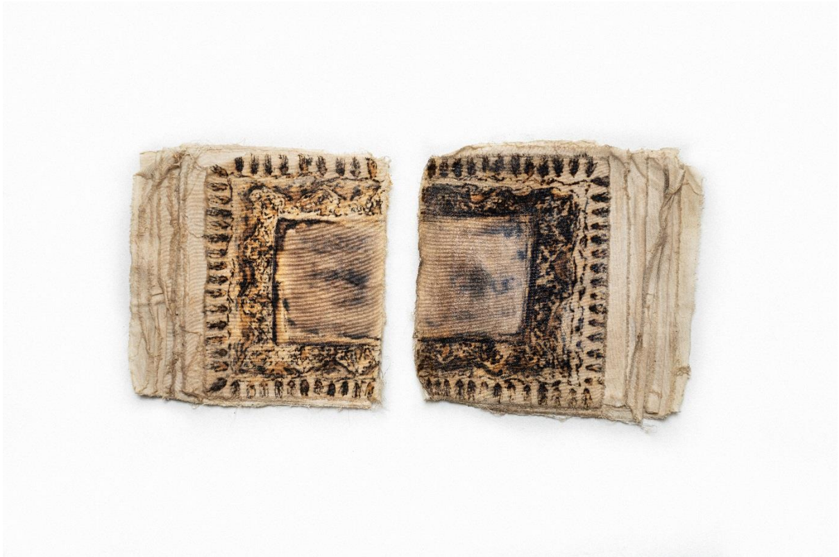
Untitled diptych (Kitaab XVIII), Ink, bleach and cold glue on canvas, 54 * 27 cm.