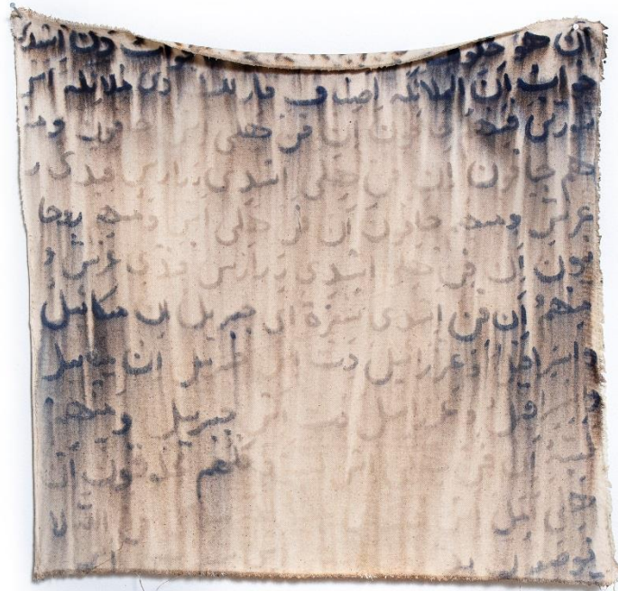
Untitled (Book of Twahid XVIII), ink, bleach and cold glue on canvas, 62 * 60 cm.