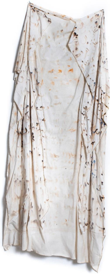
Untitled (Garment), ink, bleach and cold glue on calico, 175 * 70 cm.