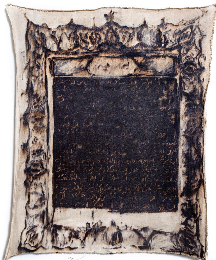
Untitled (Book of Tawhid XIII), Ink, bleach and cold glue on canvas, 96 * 75 cm