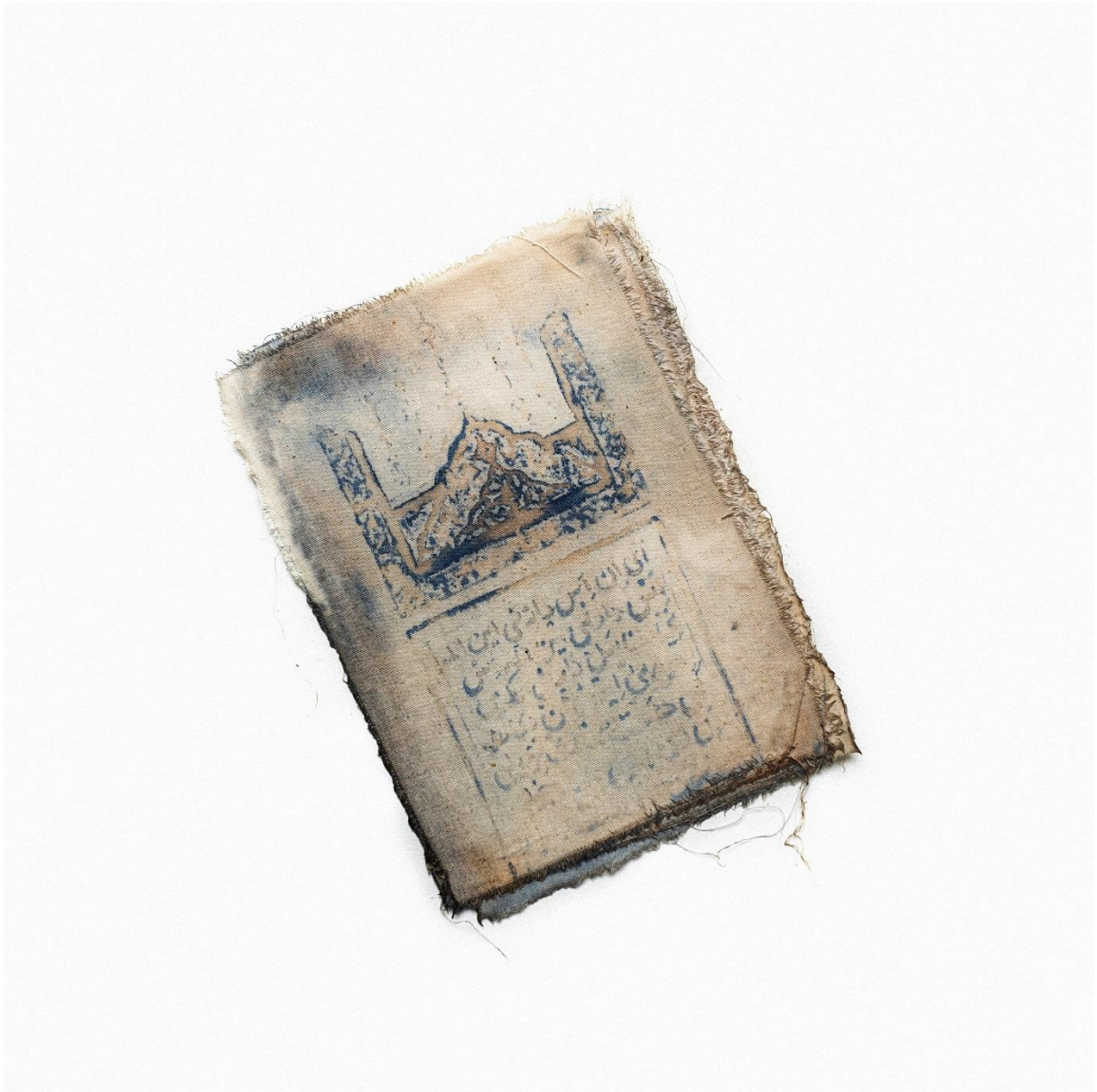
Untitled (Kitaab XVII), Ink, bleach and cold glue on canvas, 28 * 20 cm.