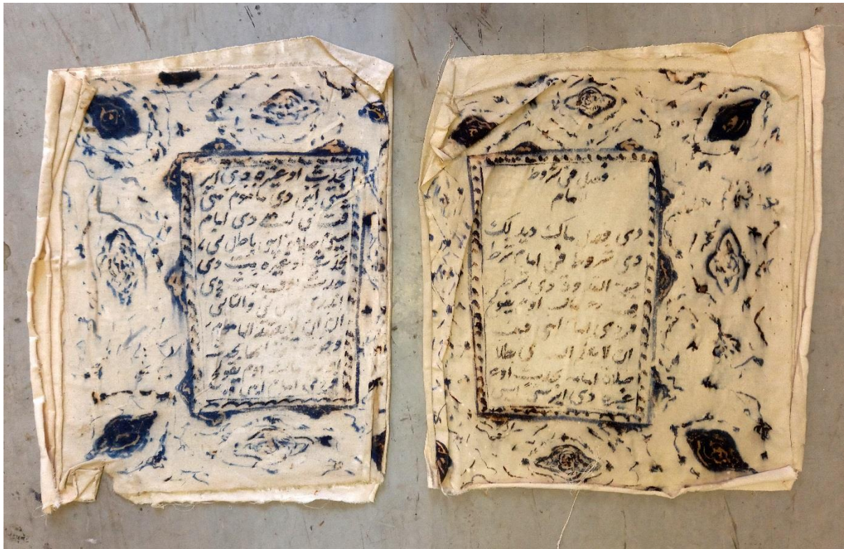
koples boek II (dyptich), 2021, ink bleach and cold glue on canvas, 134 * 77 cm.