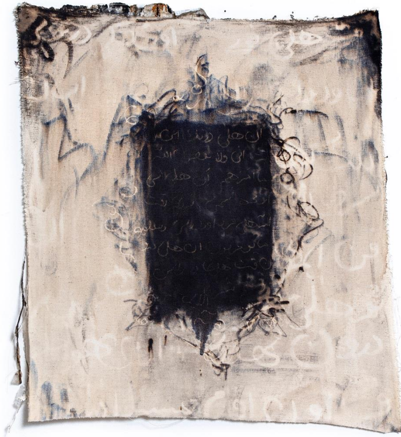
Untitled (Book of Tawhid XII), Ink, bleach and cold glue on canvas, 69*60 cm.