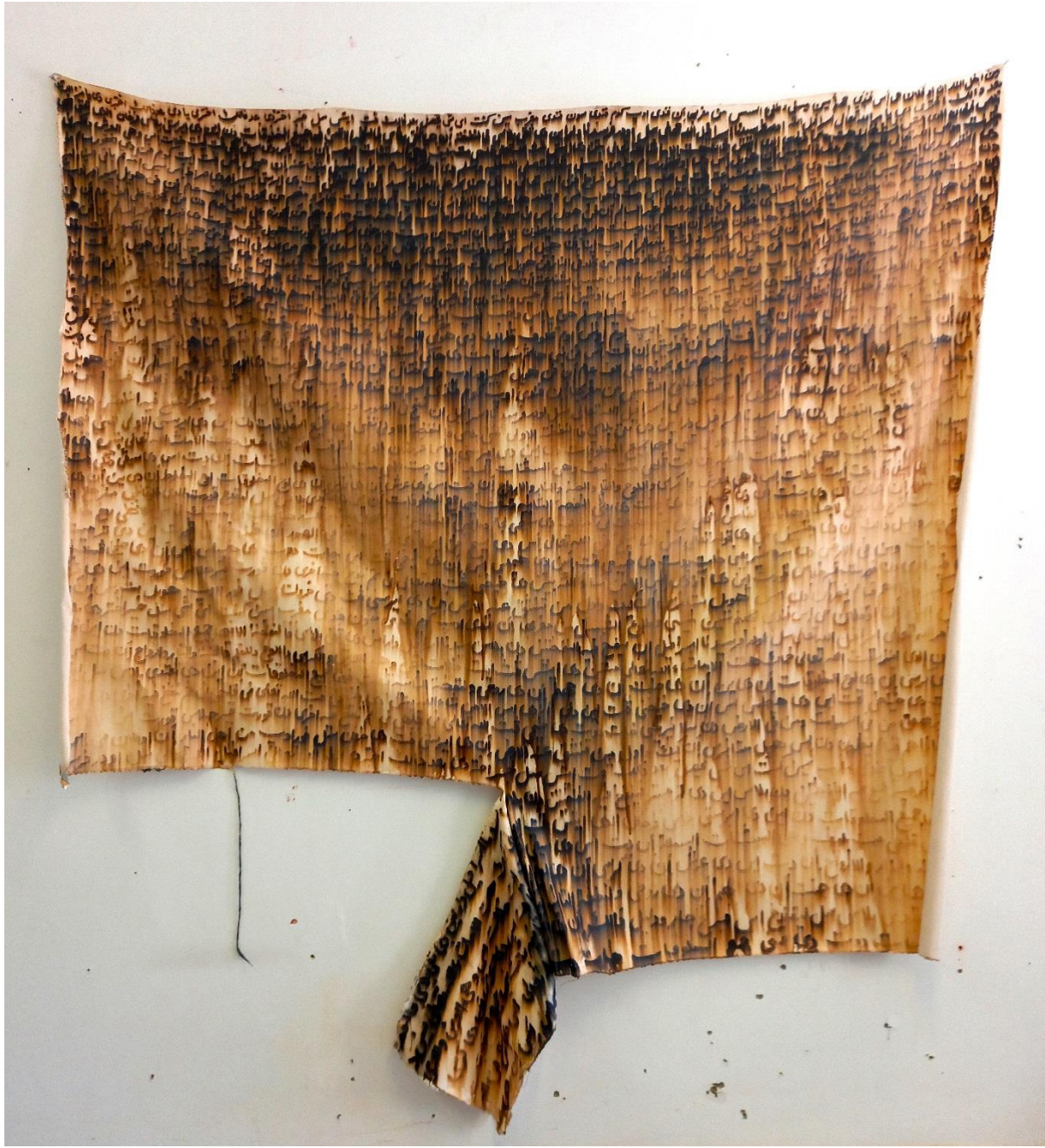
Untitled (Book of Tawhid XI), Ink, bleach and cold glue on canvas, 205 * 235 cm.