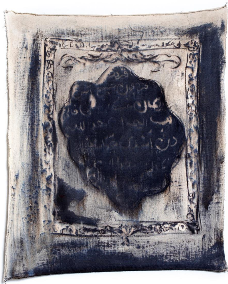
Untitled (Book of Tawhid XV), Ink, bleach and cold glue on canvas, 81 * 67 cm.