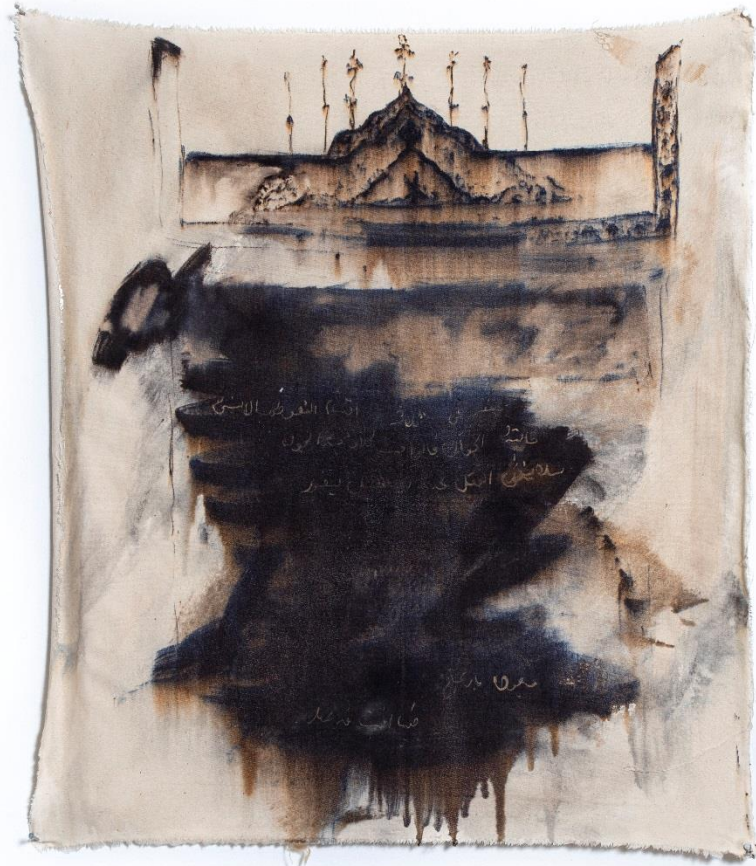
Untitled (Book of Tawhid XVII), Ink, bleach and cold glue on canvas, 80 * 71 cm.