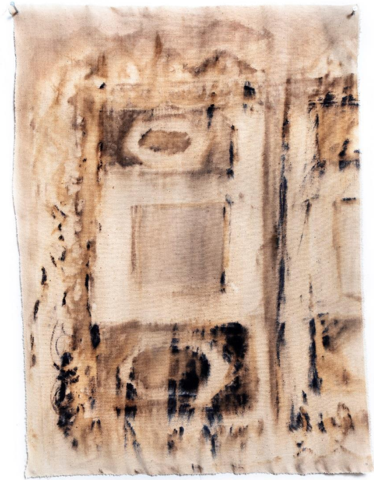
Untitled (Page I), ink, bleach and cold glue on canvas, 57 * 43 cm.