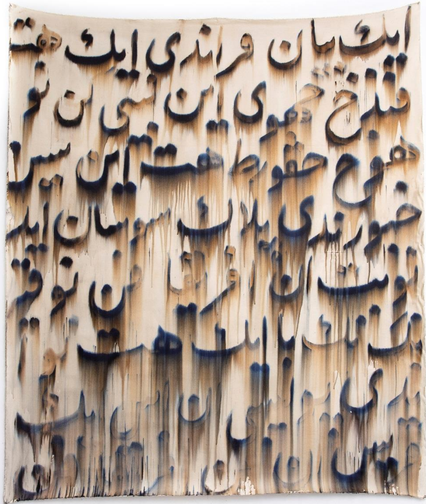
The Letter, Ink, bleach and cold glue on canvas, 210 * 182 cm.