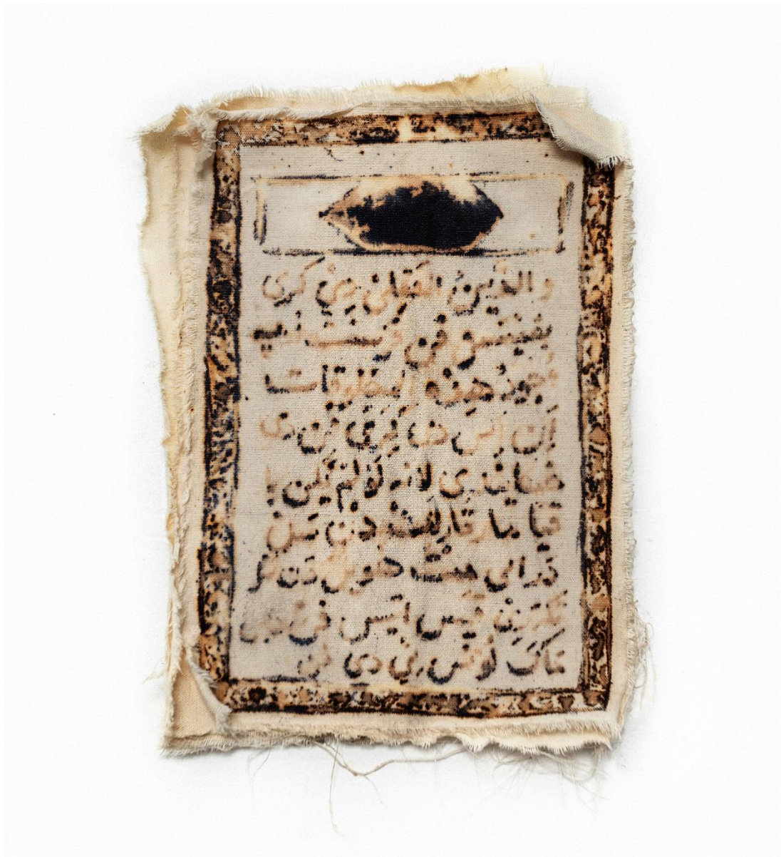
Untitled (Kitaab XVI), Ink, bleach and cold glue on canvas, 28 * 20 cm.