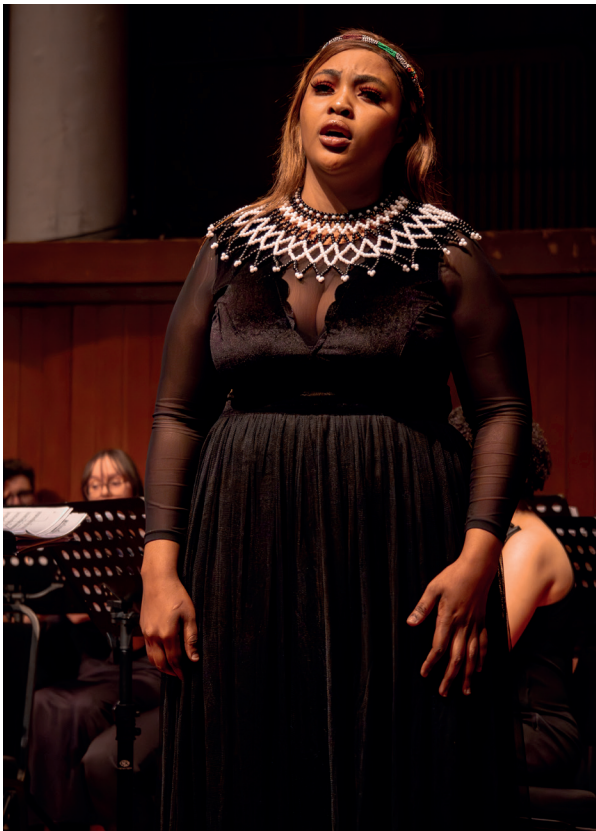
Bottom right: World premiere full staging of Donizetti's Dalinda , 4, 6-8 September, The Pam Golding Theatre at The Baxter