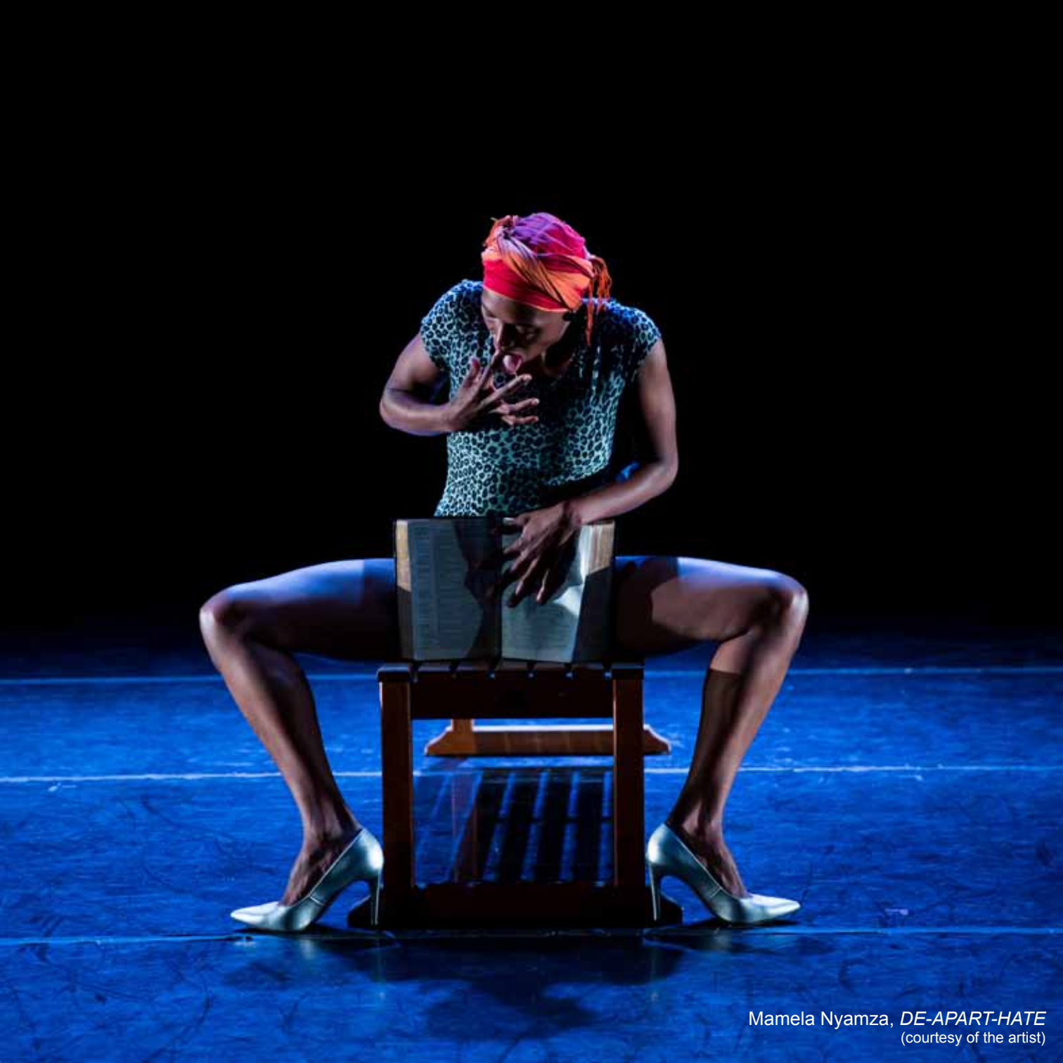
Mamela Nyamza, DE-APART-HATE