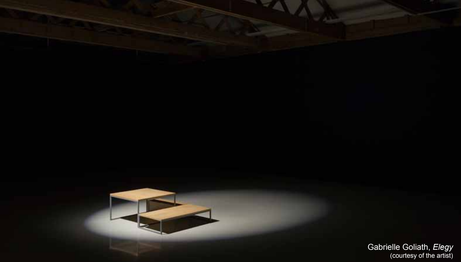
Gabrielle Goliath, Elegy